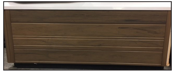
PULL PANEL ALONG BOTTOM