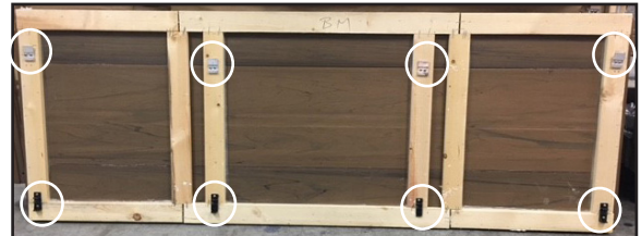
BACK VIEW (PANEL)